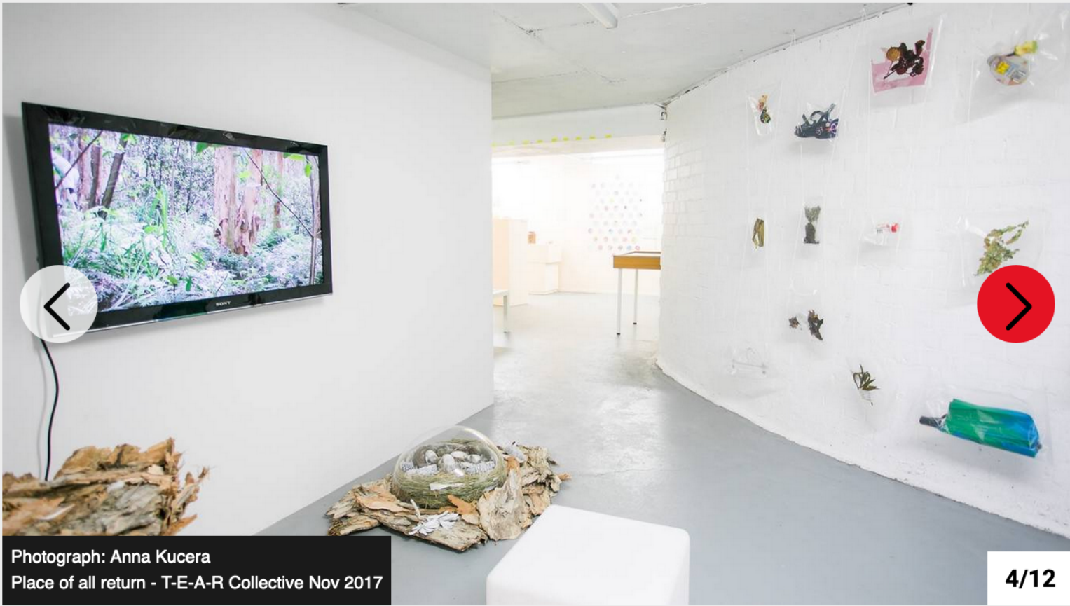
Place of all return - T-E-A-R Collective Nov 2017