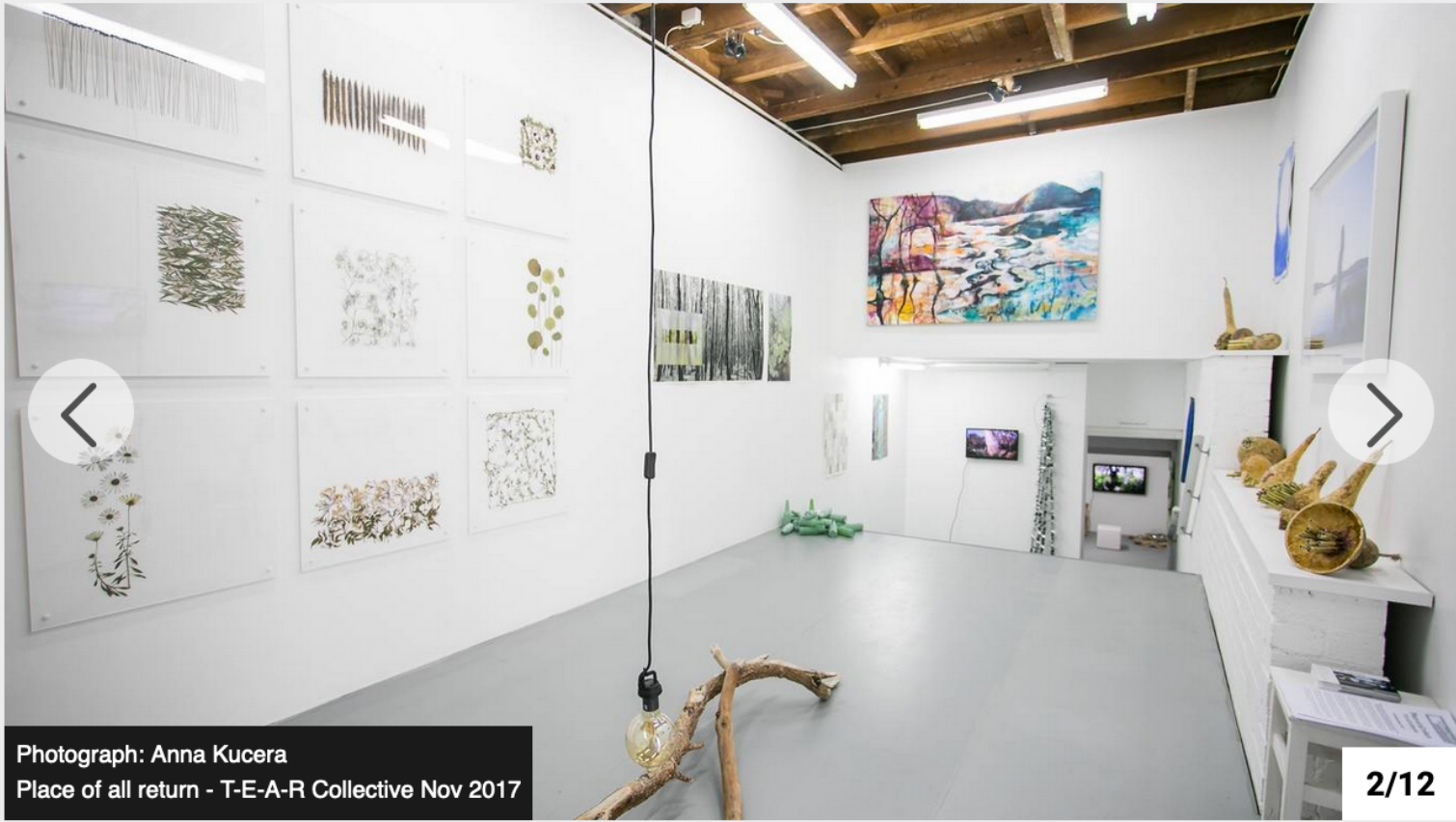
Place of all return - T-E-A-R Collective Nov 2017