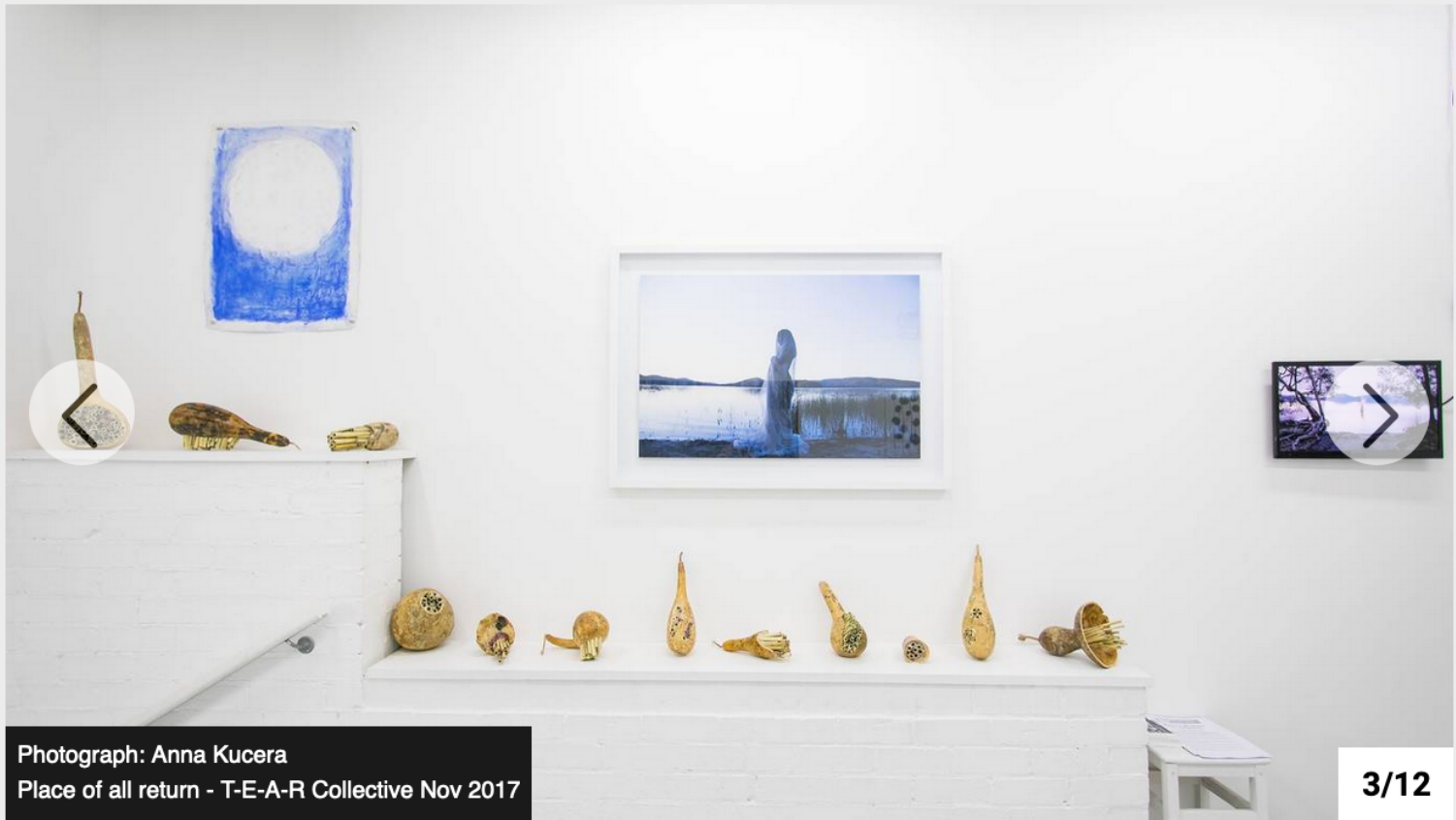
Place of all return - T-E-A-R Collective Nov 2017